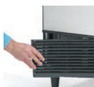
Front Air Filter